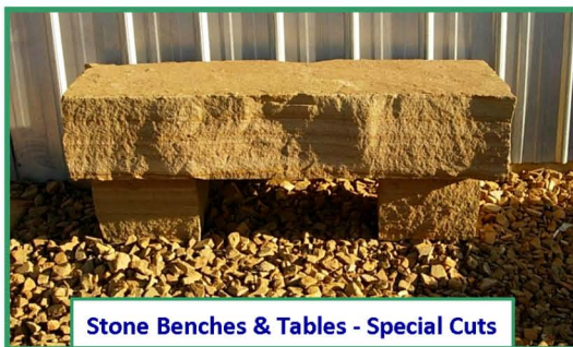
Stone Benches & Tables - Special Cuts