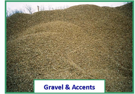
Gravel & Accents