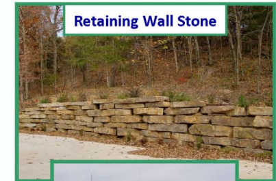
Retaining Wall Stone